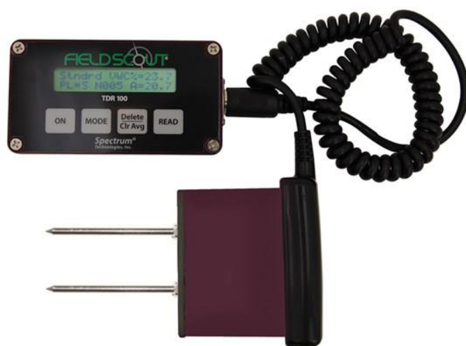
Figure 1. Handheld moisture meters are used to evaluate water needs.

In the first two years of handheld moisture meters use, ~ 10% reduction in water use was achieved as compared to pre-2009 water use.