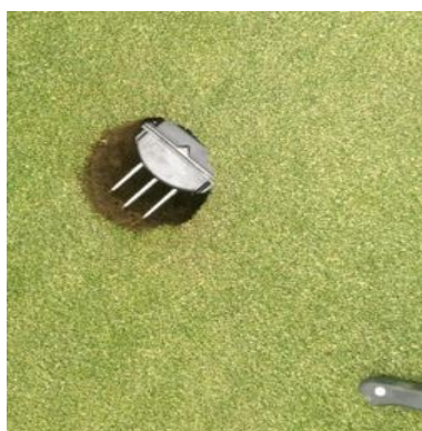
Figure 3. Meter placement on a green.

In 2012, three in-ground Toro Turf Guard moisture sensors (Figure 2) were installed — two into greens and one into a fairway. The sensors were placed in the ground by removing a cup-cutter-sized plug, inserting the meter into the hole, and covering the hole with soil and a capped plug (Figure 3). The sensors were installed in “hot spot” areas that serve as indicators for when the course is beginning to dry out.