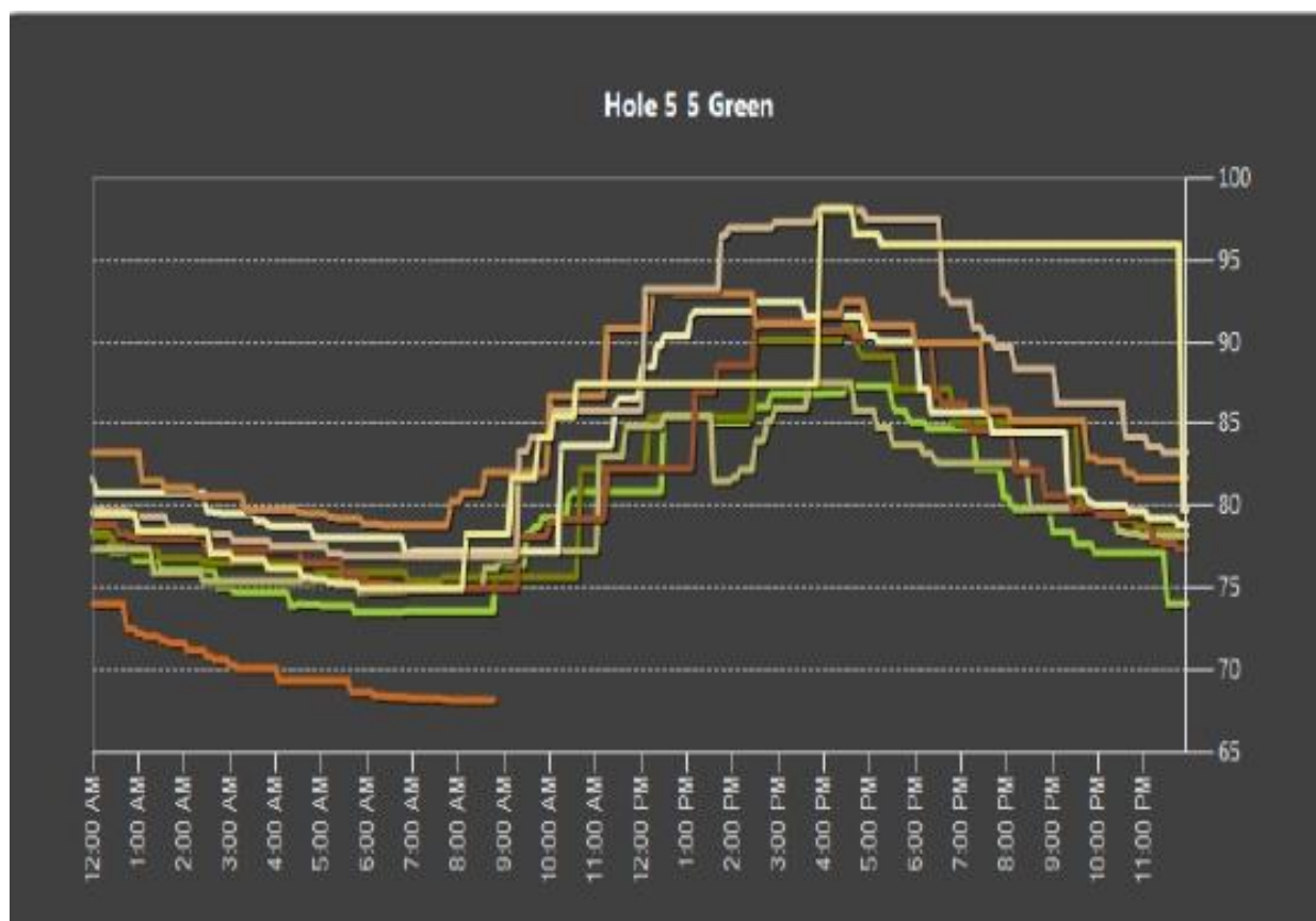
Figure 5. Daily soil temperature fluctuations at 2.5" depth in July 2015.

The ability to monitor soil temperature (Figure 5) has also proven beneficial for correctly timing crabgrass, summer patch and fertilizer applications in the spring and fall. In addition, soil temperature information can be easily communicated using the sensor data. For example, if turf is stressed during periods of high soil temperatures, providing club members or owners with this data can be a valuable communication tool.