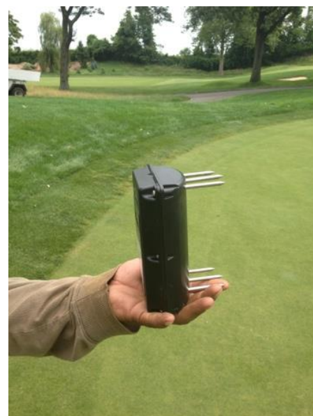
Figure 2. One of three moisture sensors installed in 2012.

The in-ground soil sensors provide real-time data on soil moisture, temperature, and salinity values at a 2.5-inch depth and 6-inch depth. The sensors relay data to repeaters in an irrigation satellite, which then relays data back to a base station connected to an Ethernet port. The data is uploaded to a server and then to a computer, providing real-time moisture values and day-to-day graphs that display the fluctuation in soil moisture content, soil temperature, and salinity (Figure 4).